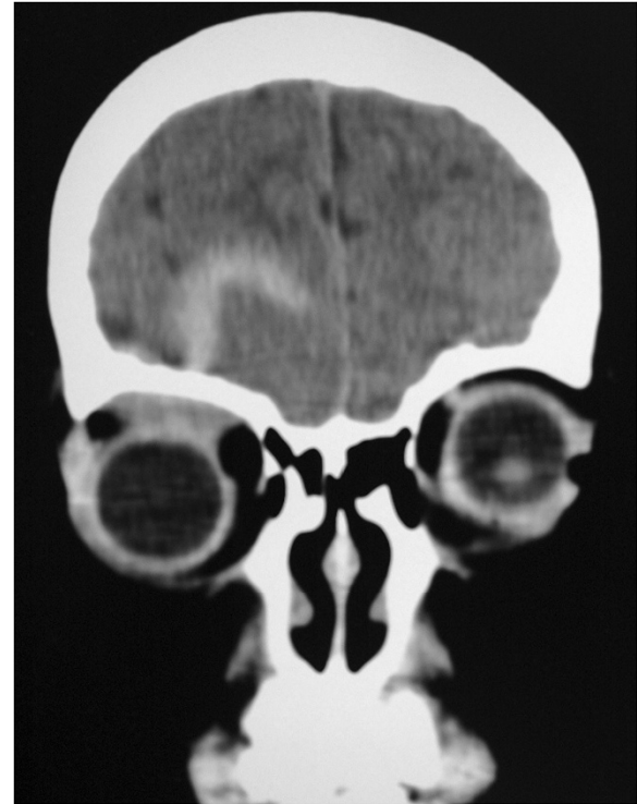
Figure 2 Reconstructed coronal view of a CT image taken at the first visit. A contrast enhanced lesion can be seen within the right frontal lobe area. A low density area is located in the right orbit, just below the upper margin.

Although the patient's exophthalmos, disturbance of upward gaze and diplopia did not improve, there were also no changes in her central nervous system symptoms. After a neurosurgeon examined the patient, surgical treatment was prescribed and performed 14 days