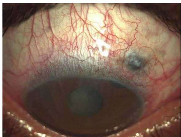
Figure 1 Preoperative: Notice the choroidal tissue under the conjunctiva.

This method does not require a special learning curve and it creates a new system of controlled humor aqueous' outflow.