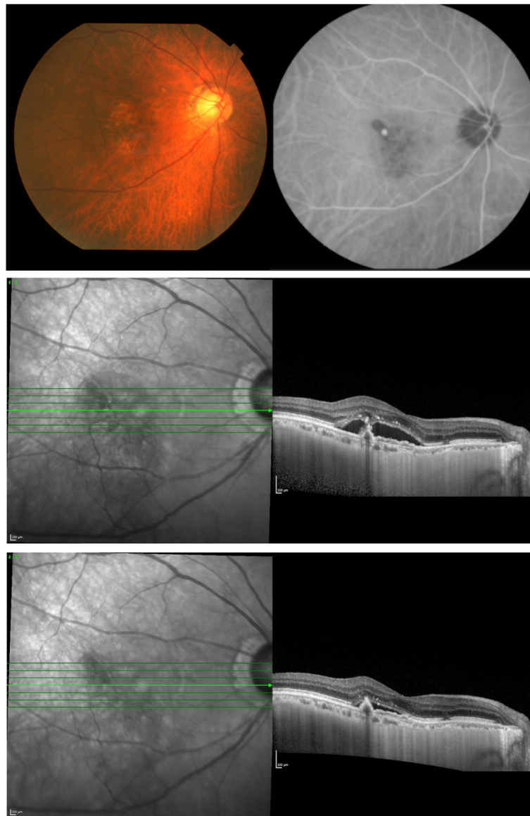
Figure 1 Fundus photograph, indocyanine green angiogram, and EDI-OCT images of an eye with normal choroidal permeability (NP group). An orange-colored polypoidal lesion can be seen adjacent to the foveal area (top left). Indocyanine green angiogram shows a polypoidal vascular lesions (top right). Choroidal hyperpermeability is not apparent throughout the examination (top right). EDI-OCT shows an elevation of the RPE layer and serous retinal detachment (middle). Seven days after intravitreal ranibizumab (IVR), the serous retinal detachment is reduced (bottom).

how PDT resolves the CSC has not been fully determined, it is assumed that PDT induces choroidal vascular remodeling with thinning of the choroid [28]. This effect was assumed to also occur in eyes with PCV by the frequent disappearance of the polypoidal lesions after PDT treatment [7].