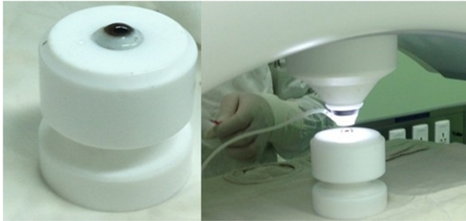
Figure 2 The eyeball fixation (left). The femtosecond laser was used to cut the donor cornea (right).