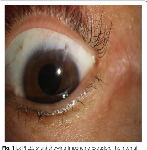
Fig. 1 EX-PRESS shunt showing impending extrusion. The internal opening was tilted to the corneal endothelium obliquely in the anterior chamber, and the external plate was prominent in the subconjunctival space