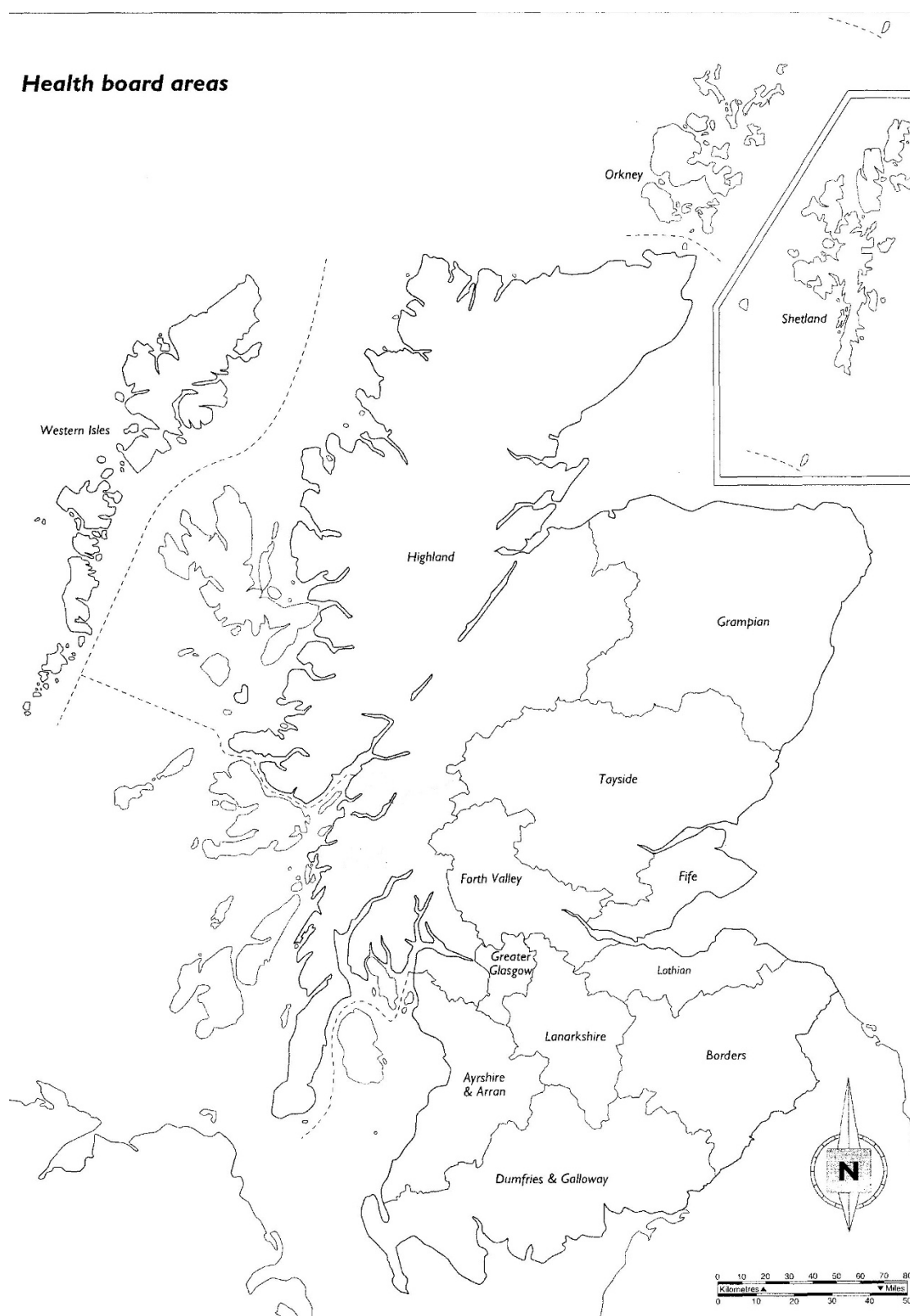
Figure 1 Health board distribution in Scotland. (Courtesy of the National Registry Office, Scotland).